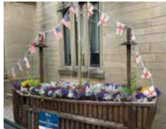
The Railway Station