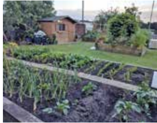
Mayflower St. Laurence's